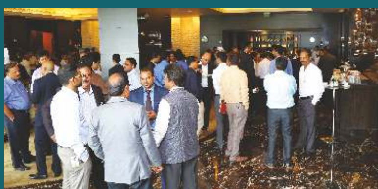
Our Other Events